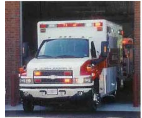
Our newest Ambulance, 852

The Pleasant Gap Fire Company has an Engine, an Engine/Rescue, a Heavy Rescue, Tanker, Brush Truck, Utility and three BLS Ambulances. We also have a fully operational antique 1936 Dodge LaFrance pumper. While the primary goal of the Live-In Program is to staff our ambulances, Live-ins are also invited to participate with the Fire Company, provided that they have the proper training.